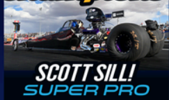
SCOTT SILLI SUPER PRO