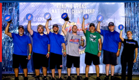
2024 NHRA DIVISION 3 CLASS CHAMPIONS

SUPER PRO, PRO, SPORTSMAN & S/P BIKE Division Champions earn a WALLY! Champion's Jacket! Champion's Gold Ring! NHRA Gold Card!