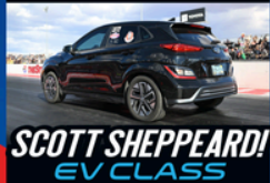
SCOTT SHEPPARD! EV CLASS