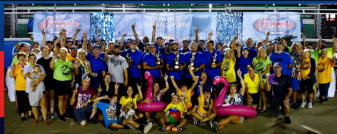
2024 TEAM CHAMPIONS - SUMMIT MOTORSPORTS PARK

BONUS RACES, SPECIAL AWARDS, EVENT SCHEDULE & MORE ON PAGE 2! |||